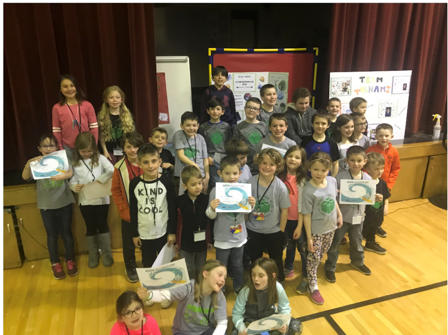
The whole Club was excited to conclude the adventure and earn their participation certificates. What a photogenic group!